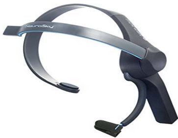
Fig. 1. Mind Wave Mobile.