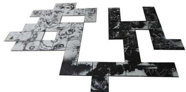
Figure 2. Aesthetical results.

solicited both in terms of virtual and physical boundaries. More than that, the playful and pitoric spirit of the game makes it so that even the weakest personalities can easily deal with the concept of borders and improve their capacity in mediating social actions without getting scared. Therefore, it has to be noticed that, URP for the very same reasons kind of stimulate the self-consciousness of both aggressive and remissive personalities. This makes of it a good candidate has method to be used in art-therapy.