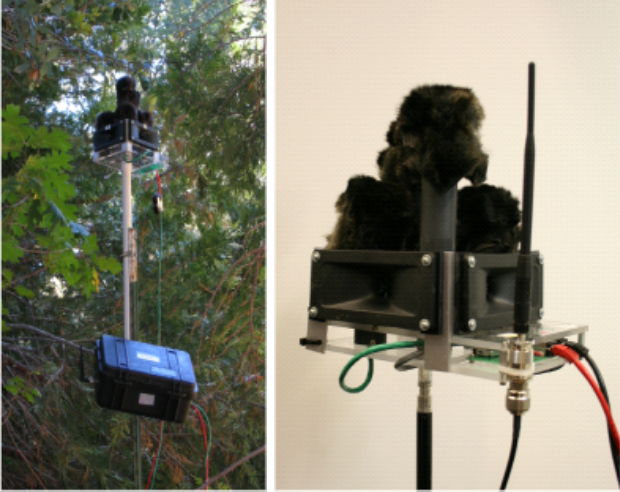
Figure 1: Left : Acoustic ENSBOX, the embedded device we used for our experiments. Right : close-up of the microphone array.

For our experiments we have developed a network of Acoustic Embedded Networked Sensing Boxes (Acoustic ENSBox) as a prototype for wildlife monitoring system [5, 6, 7]. Each system is a small embedded computer running Linux, self-contained in a waterproof case, with an external four microphone array and 802.11b wireless communication (Figure 1). In com-