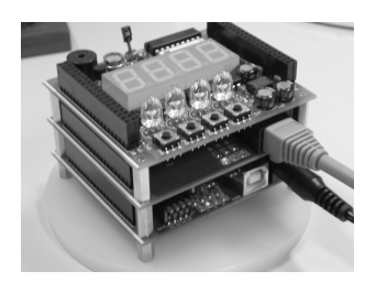
Figure 1: Photo of a Stacked Micro Cube

The Micro Cube is a board computer and is composed of several stackable boards [2, 3]. Fig. 1 is a photo showing one of the combinations of stacked Micro Cube. It has a CPU board with a RENESAS H8 CPU and a TCP/IP Protocol stack. Stackable boards can vary as follows: Ethernet LAN board, compact flash board, PCMCIA board, serial board (RS232C and RS422) and so on. Since the different combinations of stackable boards make a seamless connection with the sensors, users can structure an ad hoc sensor network very easily. To get sensor information through the Internet, HTTP is also employed so that user can get data via a standard Web browser.