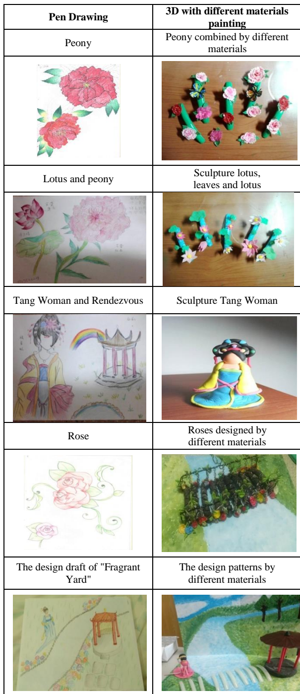
Fig. 1. The creative design and actual creation

densely forested and full of branches and quite brilliant when flowering, is loved by poet and general people in China.